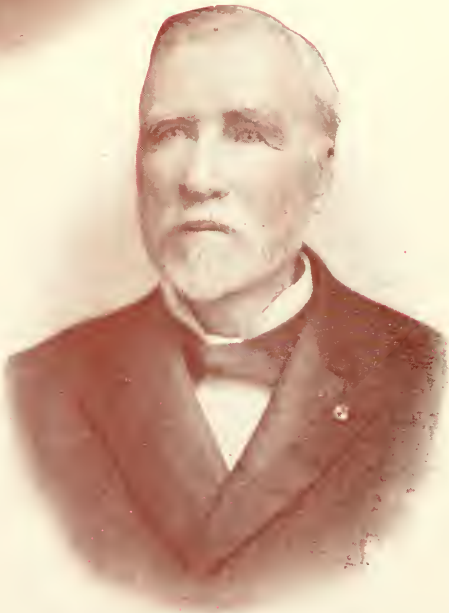
JOHN CORSON SMITH, 33 d Grand Minister of State